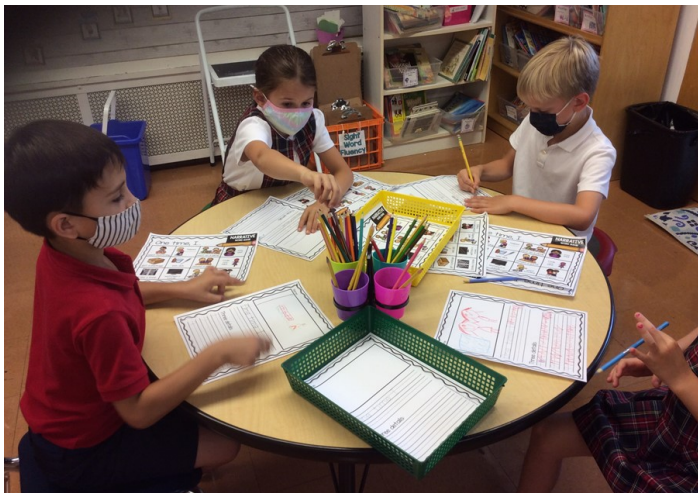
1st grade learning Daily 5. 1st graders are reading to self, reading to someone, working on writing, and doing word work!