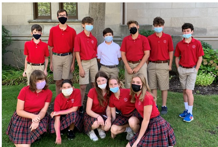
8th grade after leading their first all school mass of the school year!