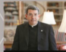
Parish Center at Sacred Heart