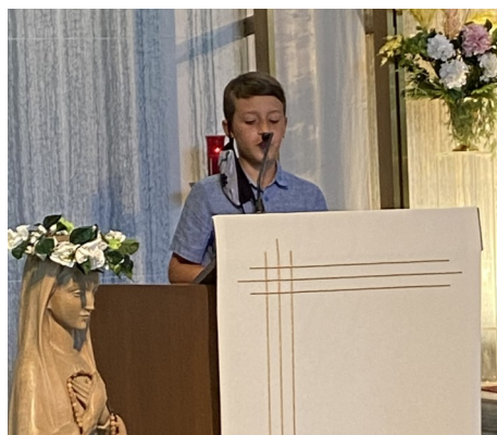
Children brought joy and meaning to our special crowning of Mary!