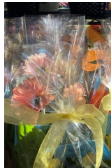
Flowers for our catechists