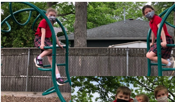
3 rd graders enjoyed some time outside