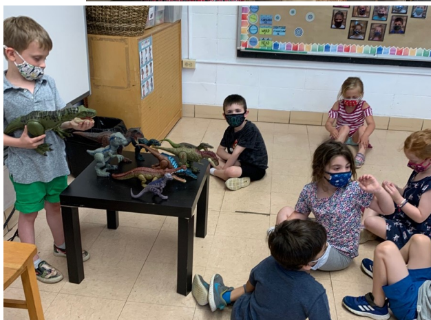
The Full Day JKers are wrapping up the year by sharing collections with the class! They have discussed different ways the collections can be grouped and sorted, their favorite pieces in their collections, and how long they have been collecting. They have felt a lot of pride sharing their special treasures and have developed a sense of ownership over them!