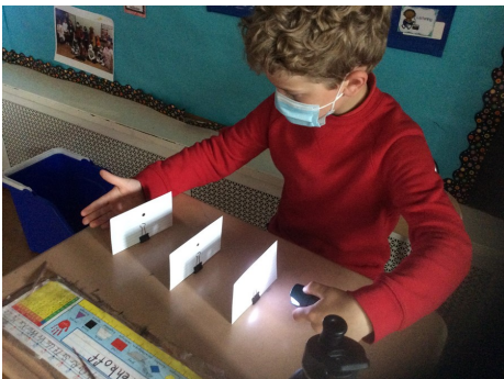
1st grade learns about light energy through two fun experiments. They also painted the sun, our natural source of light energy.