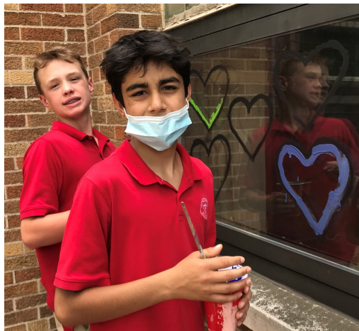
For their last art class, the 8 th graders painted hearts out on the gym windows!