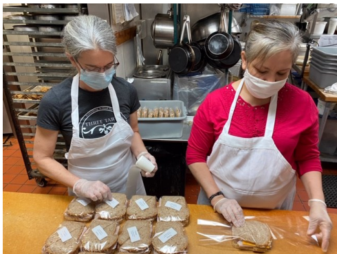
The Owners of Three Tarts in Northfield

We have been working on ways to continue assisting A Just Harvest in their mission to provide nourishment to those in need while following the new guidelines. Given the huge number of meals being served each week, we contacted the owners of Three Tarts to see if they could help. If you aren't familiar, Three Tarts is a small business/bakery/sandwich shop that has operated a commercial kitchen in Northfield since 1998.