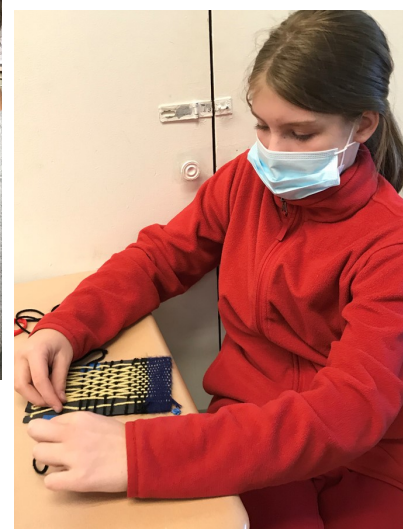
The 6 th graders practicing the art of weaving.