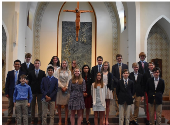
The 8 th graders did a wonderful job leading us honoring Mary during our May Crowning Mass.