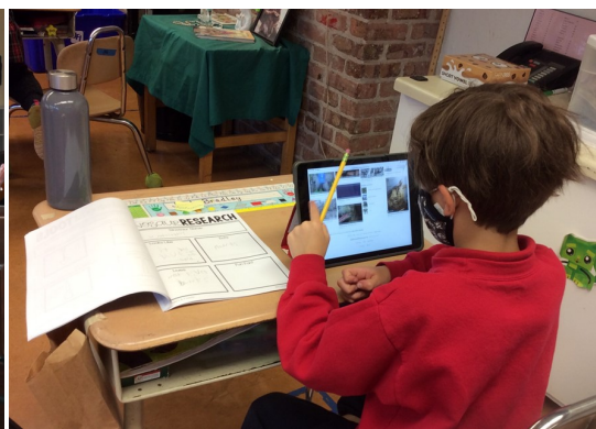
1 st graders are researching a dinosaur and will share what they learn with the class.