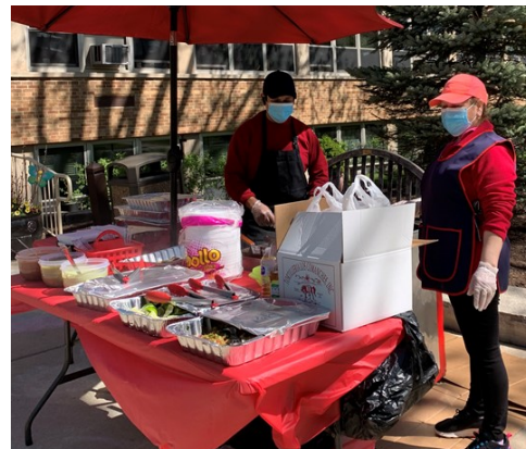
Last week we celebrated Teacher Appreciation week with a food truck! Our wonderful Parent Association brought this incredibly tasty Cinco de Mayo meal for the teachers!