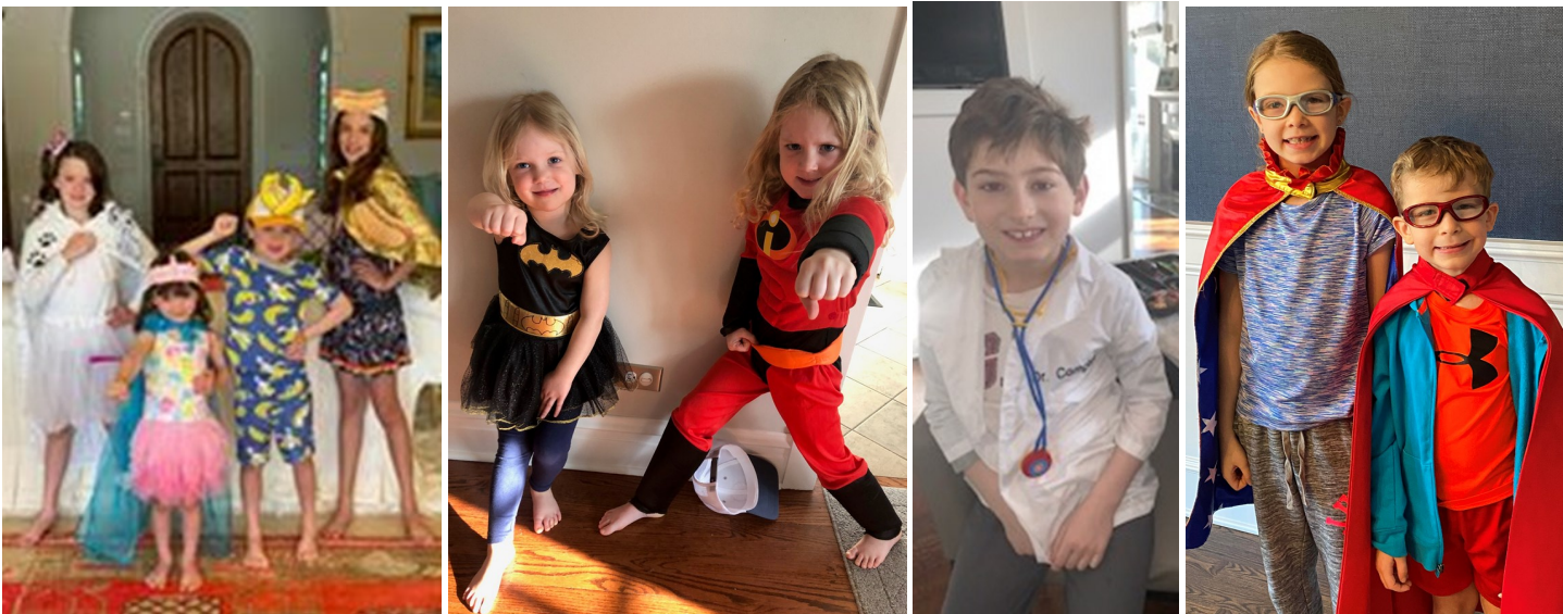
Wednesday was superhero day. Students could either dress up as "traditional superheroes," or anyone they consider a superhero.