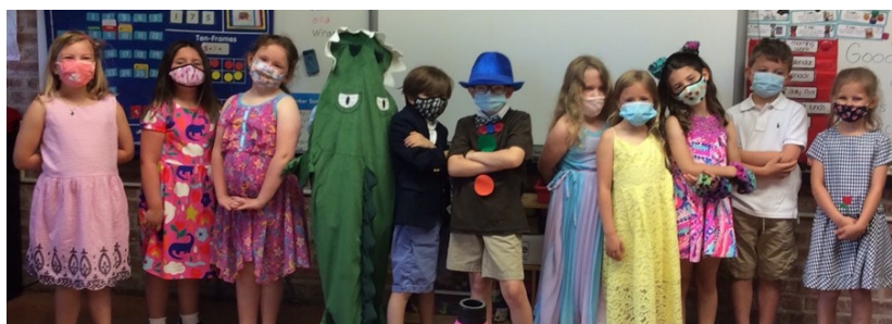
We made it all the way to the last day of school! Have a wonderful summer!