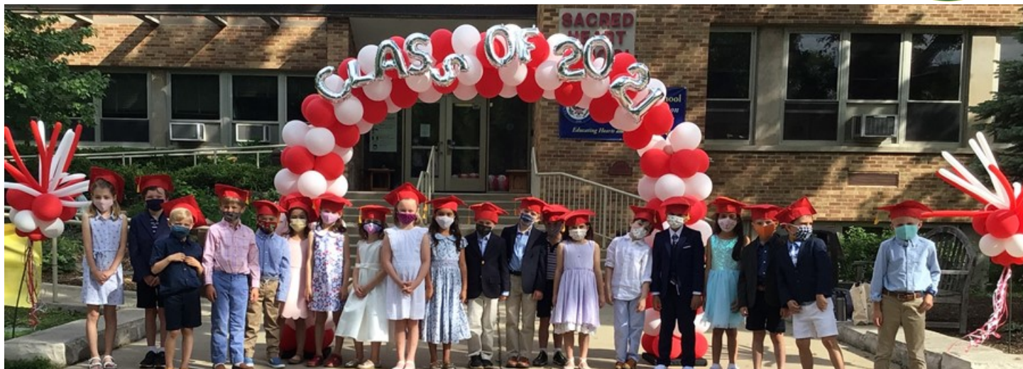
CONGRATULATIONS to our Kindergarten graduates class of 2021!