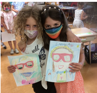
The first graders' Fun Friday pictures!