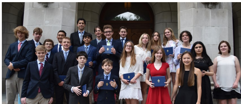
Congratulations to the Sacred Heart School class of 2021!