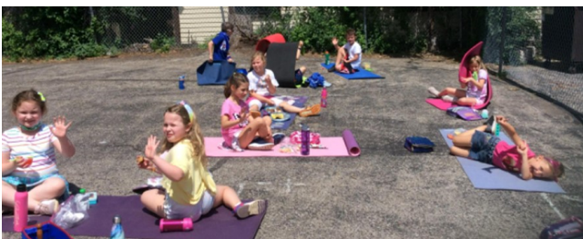
We LOVE our Sacred Heart Field Day!