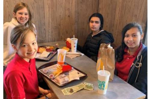
Before break our 7<sup>th</sup> graders were rewarded with an off campus lunch for working hard at their core values!