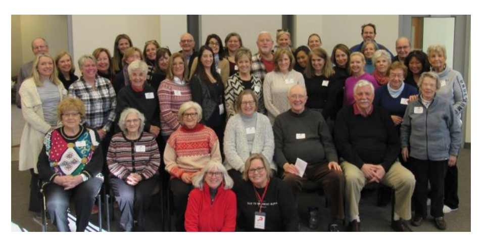
Some members of our recent Wednesday morning Alpha group.

Some members of our recent Monday night Alpha group.