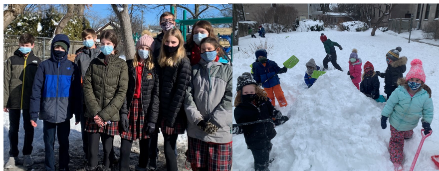
WE ARE HAVING SNOW MUCH FUN!!!