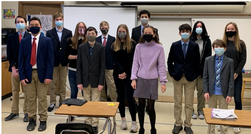
Our 8 th graders all dressed up for their final Sacred Heart yearbook pictures!