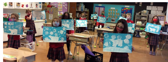
The first graders finish their polar bear unit by making a polar bear book and polar bear paintings!