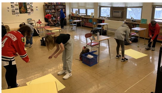
On Tuesday of Catholic Schools Week the theme was "teamwork." Putting that theme in action, the 7 th grade religion class played a variety of team building games like the one pictured... the Flying Pen ! They also played Follow the Details , Race to 40 , and Roll the Dice to Break the Ice !