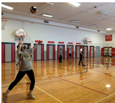
A perfect socially distanced volleyball game between the 8 th graders was watched via Zoom by the entire school!