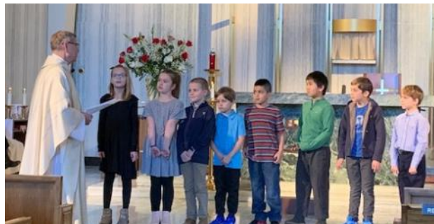
They are enrolled and ready to prepare for the sacrament of First Communion!