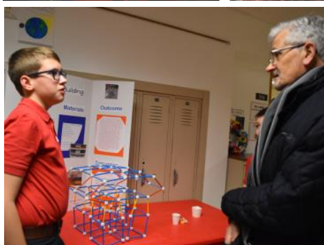
The Junior High students presented their STEAM projects at the Academic Fair during Catholic Schools Week. They were amazing!