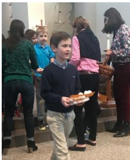
Delivering the sheep prayer cards was great fun for the children!