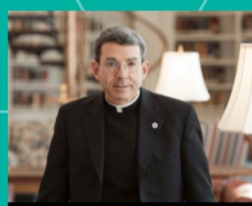
Divine Mercy Parish Center