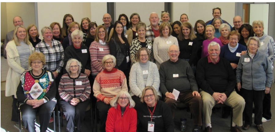
Some members of our recent Wednesday morning Alpha group.