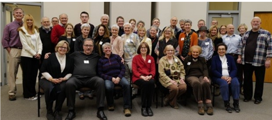
Some members of our recent Monday night Alpha group.