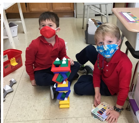
Kindergartners having fun and so happy to be able to play at school with friends!