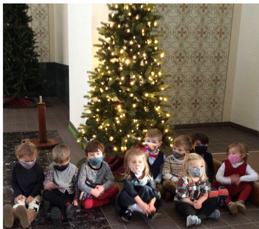
Pre-school students dressed in their "Sunday Best" are getting ready to make their Christmas video for Candles and Carols!