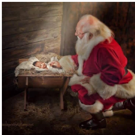
The Reason for the Season!