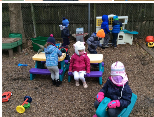
Even though you can't see their smiles...JKer's and preschoolers are so happy to be here!