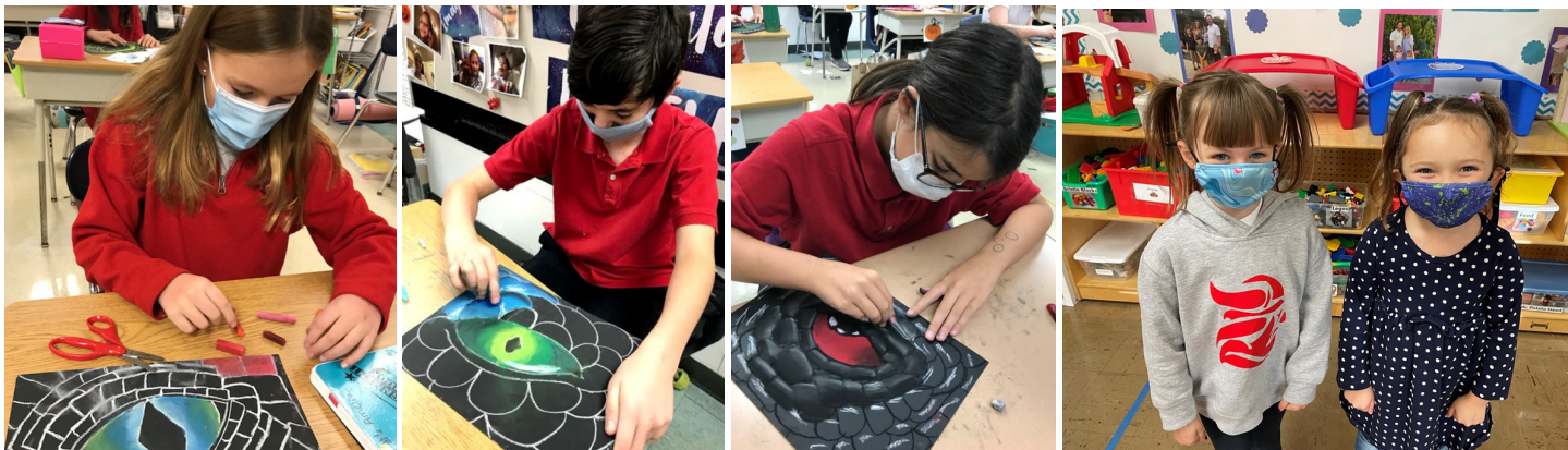
Here are some photos of our 4th and 5th graders in art class learning about value while drawing cool and colorful dragon eyes.