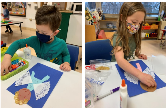
Our talented JK'ers are making their beautiful Christmas angels.