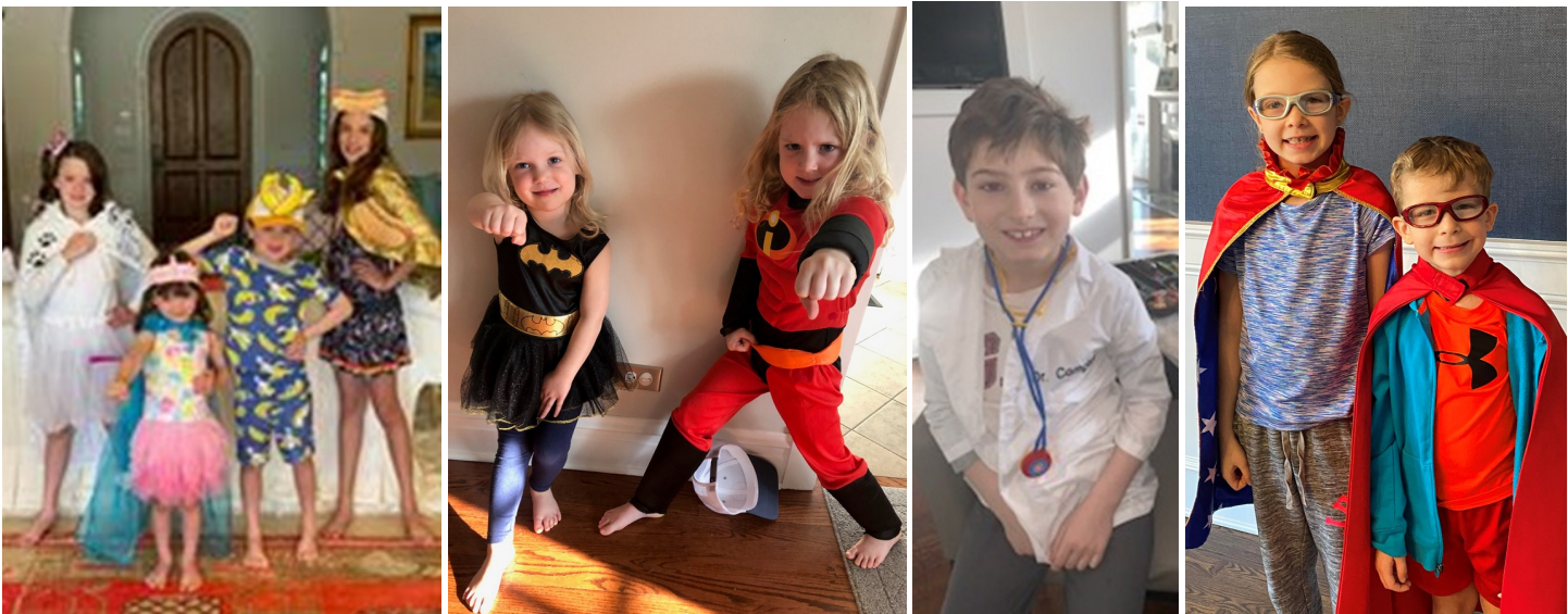
Wednesday was superhero day. Students could either dress up as "traditional superheroes," or anyone they consider a superhero.