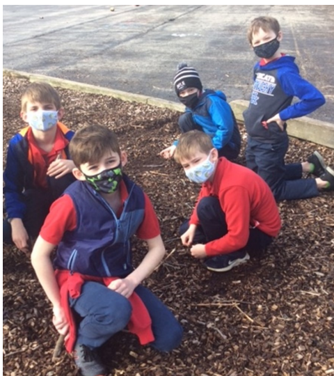
3 rd grade enjoying the great outdoors!