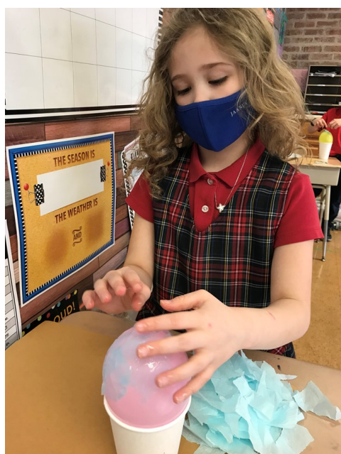
In art class 2 nd grade is working on their handmade Easter baskets!