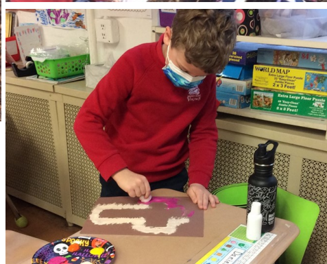
1st grade paints beautiful crosses!

7th grade is learning about cells. The chicken egg makes a perfect model for exploring the selective permeability of the cell's membrane. The tricky part is removing the shell and handling the very delicate "cell". Once the shell was removed, students needed to weigh their eggs before and after submerging them in different types of liquid. They were asked to explain why their cell's weight fluctuated depending on the liquid they were submerged in. It is a terrific way to visualize osmosis and cellular diffusion.