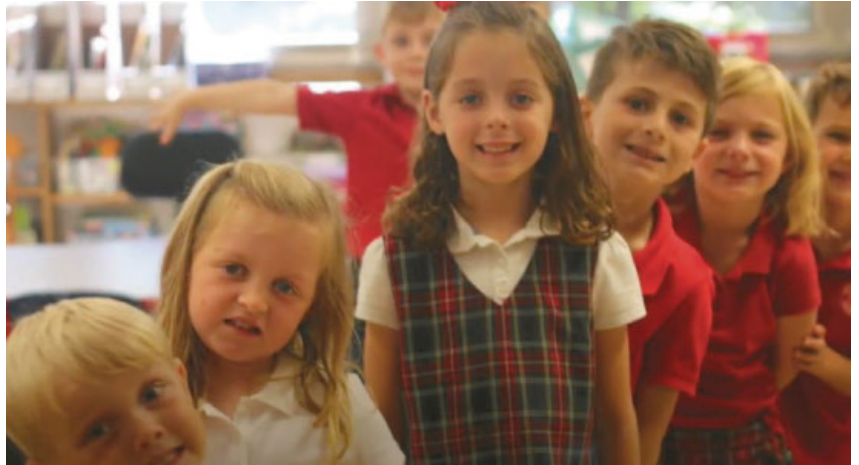
Kindergartners are learning about the weather in their classroom!