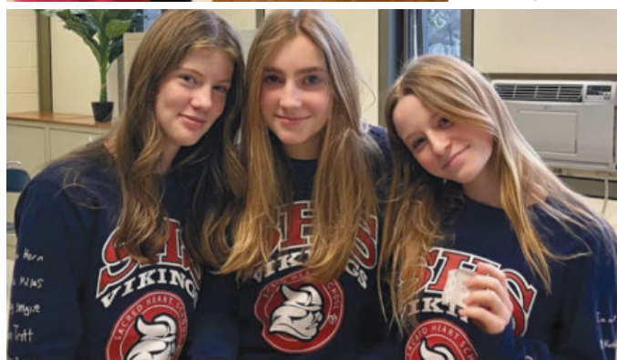
8th graders sporting their 8 th Grade shirts!