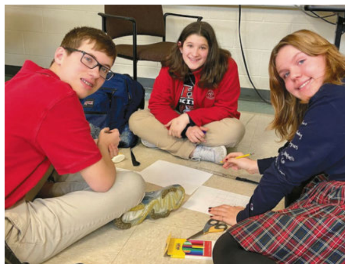
In advisory class the 8 th graders are making conflict resolution board games!

Our second graders are preparing for Mass this Wednesday.