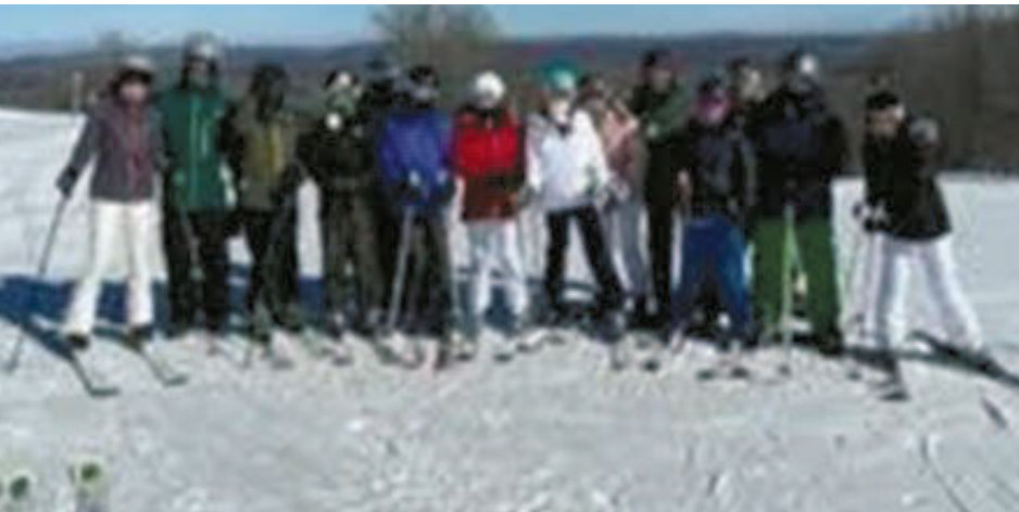
8 th Grade Ski trip!