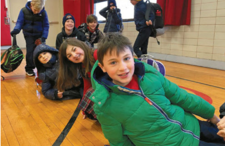
Smiling faces at our morning assembly!