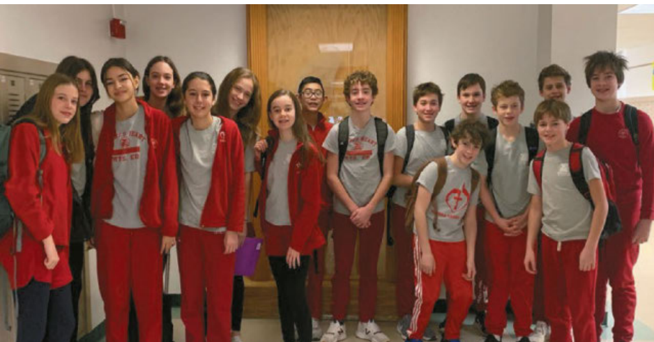
7 th grade is happy it's gym day!