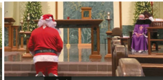
Santa came to Sacred Heart to pray and bring a gift to baby Jesus.