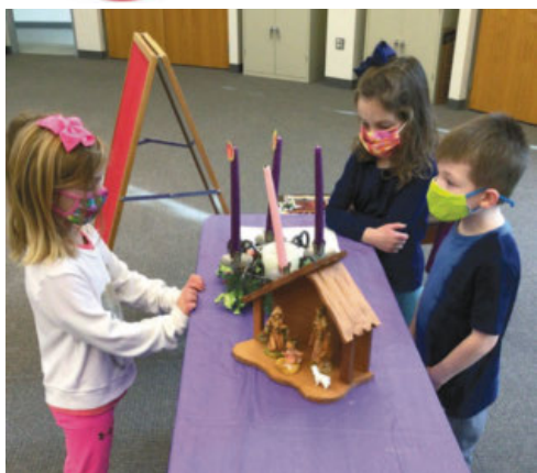
It's time to light the pink candle!