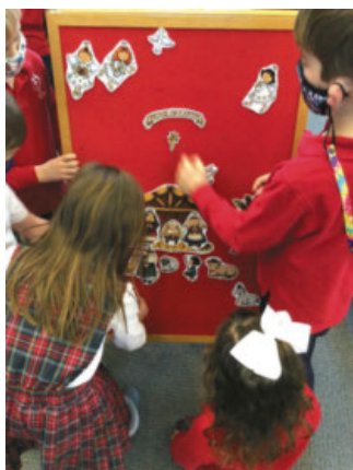
The early childhood students preparing for the coming of baby Jesus.