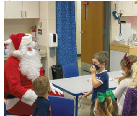
The children had lots of wishes for Santa! Santa asked the students to go to bed early on Christmas Eve and to be nice to their teachers and parents!