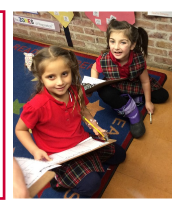
First grade did a fact versus opinion mission around the classroom in search of spiders for science class! Yikes!

Mon. Dec. 2<sup>nd</sup> 7:30am Online Early Childhood Registration Tues. Dec. 3<sup>rd</sup> Advent by Candlelight Fri. Dec 6<sup>th</sup> Spirit Wear Day Dodgeball Party Sat. Dec. 7<sup>th</sup> Catholic High School Entrance Exams