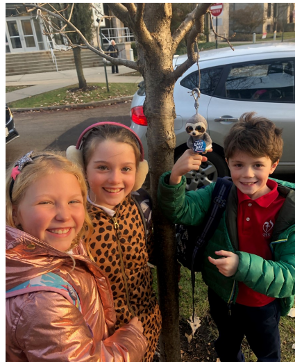
Looking forward to the "Fun Run!