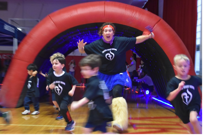
It was a school transformation! So much running and so much fun! THANK YOU to everyone that was so generous to help support our incredible school through the Viking Fun Run!