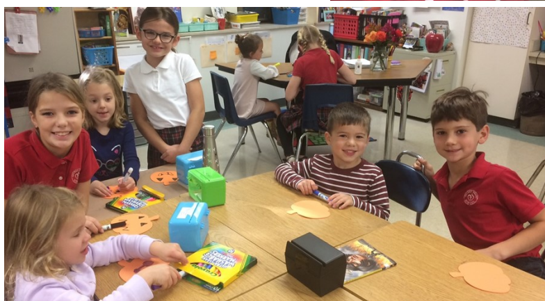
Kindergarten works with pattern blocks to form Halloween themed pictures while working on math concepts!