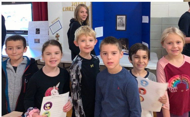
On a scavenger hunt to learn more about the saints' lives!