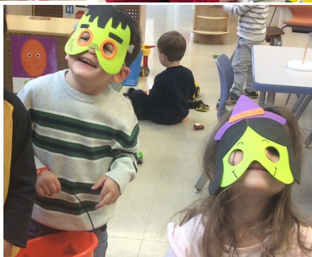
Preschool classes practiced how to Trick or Treat!