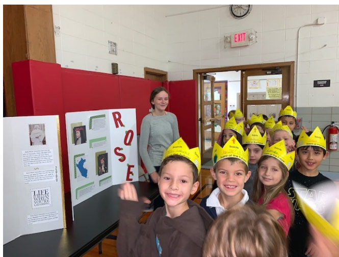
Visiting the Celebration wearing "Future Saint" crowns!

More than 40 Confirmation candidates of Divine Mercy Parish presented their chosen saint last Sunday at a Saints' Celebration held at both the Sacred Heart and St. Philip's campuses. The students chose a saint and prepared a detailed report of their saint's life and what inspired them. They learned about the hardships many saints faced, and the miracles that are attributed to their canonization. They provided photos of their saints and brought in artifacts. All of our other students and families had the opportunity to visit the celebration. Our youngest students made crowns honoring the saints and the older students conducted a scavenger hunt to learn even more about these amazing lives. What a great tribute to our saints as we celebrate All Saint's Day here at Divine Mercy Parish. Great job, 8th graders!