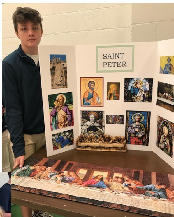
A wonderful report about the life of Saint Peter was highlighted by bringing in grandma's amazing jigsaw puzzle depicting the Last Supper.