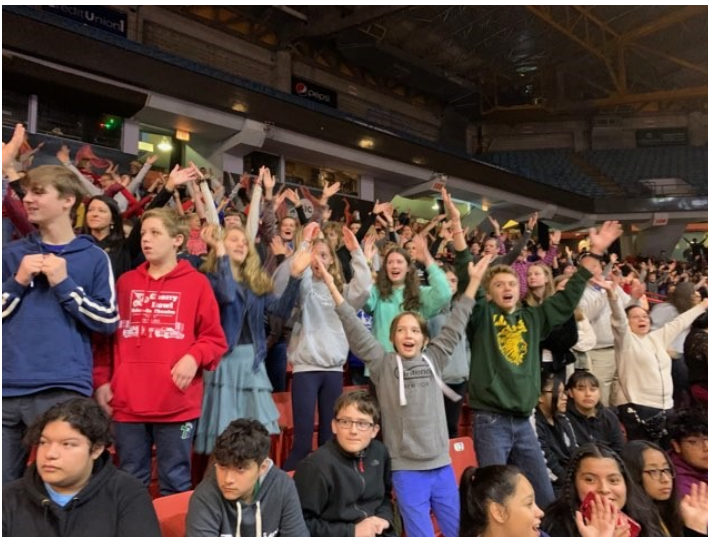
Dancing, jumping and singing to start the day!

Holy Fire, an all-day "spirit rally" hosted by the Archdiocese of Chicago in an effort to engage 6th-9th graders into the faith, was held on Saturday, October 19. Twenty teens, parents and members of Divine Mercy Children's Ministry carpooled to the UIC Campus to attend the fun, high energy, impactful day. "As community youth comes together, they are challenged to participate in activities centered around prayer, witness and joy... Ultimately, Holy Fire helps young people to see themselves as witnesses of Christ and members of a young Church," explains the Holy Fire team. Next year, we hope even more teens, parents and members of our parish community will join us for this special experience of faith.