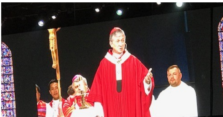
Celebrating Mass with Cardinal Cupich