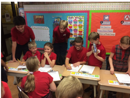
7th grade and 2nd grade buddies met this week. They had fun getting re-acquainted by taking turns interviewing each other!

Friday, 10/18 P.A. Meeting 8:30am Parish Center HOMECOMING PEP RALLY! 2:30pm School Gym