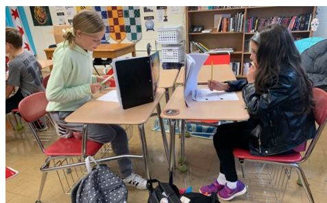
Last Friday, the 5th graders were able to play "Batalla Naval," also known as Battleship, in Spanish class. Rather than using numbers and letters, they had to use pronouns and verbs in order to pick their coordinates. They then had to conjugate the verbs using the pronoun in order to find their opponents' ships. They had a blast playing this game, and it was great practice for conjugating -ER, -IR, and -AR verbs in the present tense!