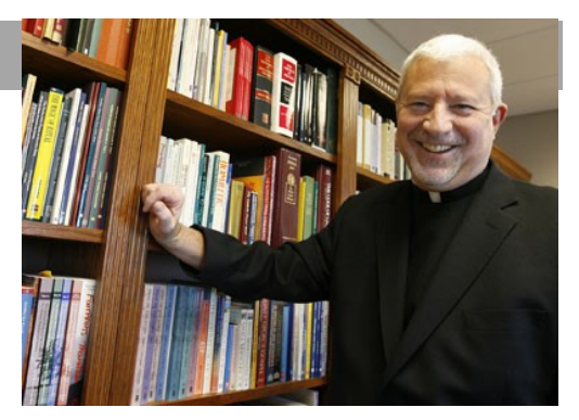
with whom they come into contact.

This is what Renew My Church is all about. It's not about changing structures and operations (that's a part of it, but only the surface). The deeper reality of Renew My Church is all about changing the hearts of those who call themselves "Church", so that members begin to see themselves not as mere members, but as disciples, disciples who are being sent by Jesus into the world to bring his Good News to all those