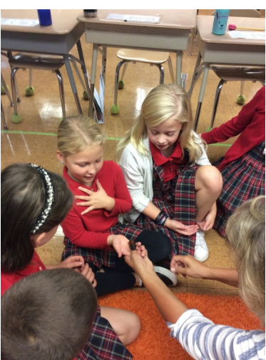
During our morning assembly we did a Mindfulness Monday exercise to get us focused and ready for our day.