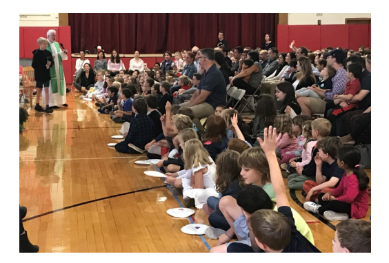
A special blessing was given to our Catechists, as they begin their ministry this year. Thank you to all of the children and families who participated!