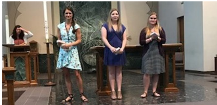
We bid farewell to these amazing teachers and wish them well in their new endeavors!