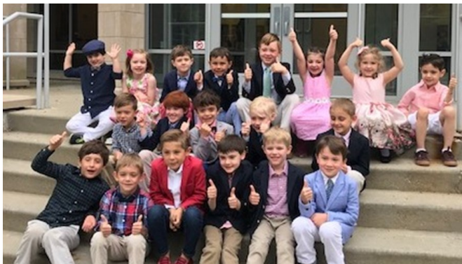
Congratulations to our Kindergarten Graduates!