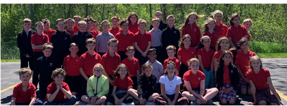
The 4<sup>th</sup> grade traveled to Lake Villa to meet their pen pals from Prince of Peace Catholic School! So fun to finally meet as they have been writing to each other since September!

Friday, June 7<sup>th</sup> Last day of school for grades 1<sup>st</sup> – 7<sup>th</sup> Mass 12:30pm Dismissal for SUMMER! 1:20pm