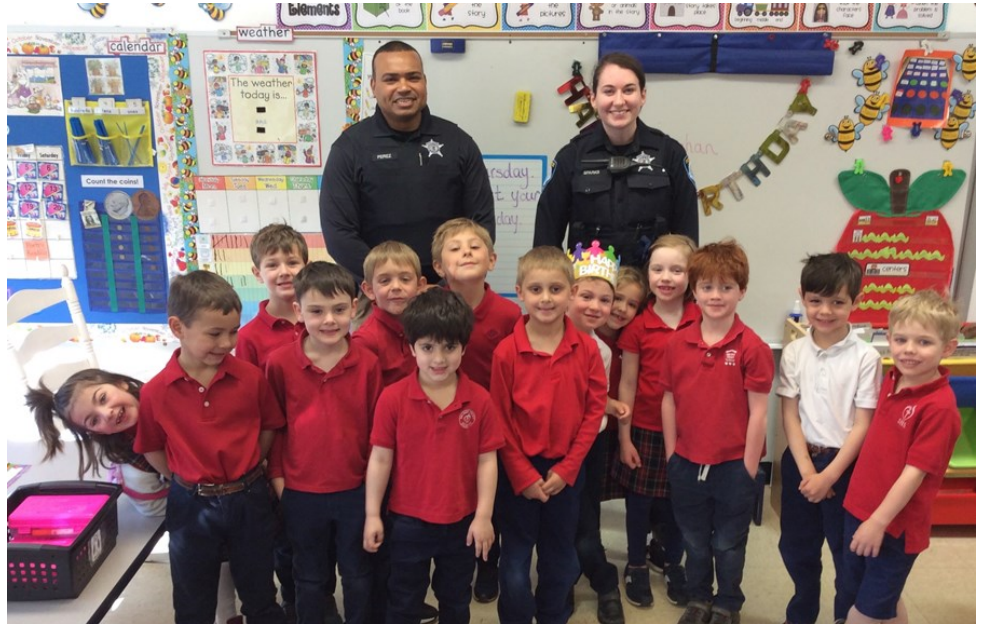
Officer Friendly came last week to talk about bike safety as spring is hopefully around the corner!