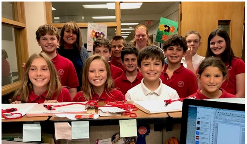
We are celebrating our office staff this week with beautiful and thoughtful cards and posters!

Saturday, May 11 th First Communion 10:30am Church