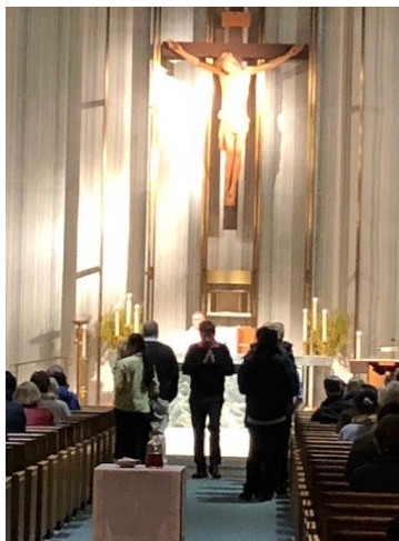
Lighting of the Easter Fire and the Paschal Candles from St. Philip and Sacred Heart Churches.